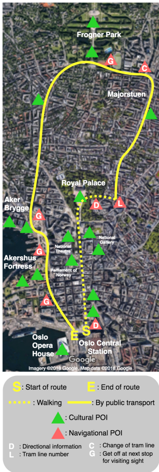
Figure 5: The route and the POIs of the AudioTransit study.

sample size. Overall, an iterative design process based on the collected user feedback will take place, leading up to a large-scale evaluation of AudioTransit in the context of tourist groups of two or more users.