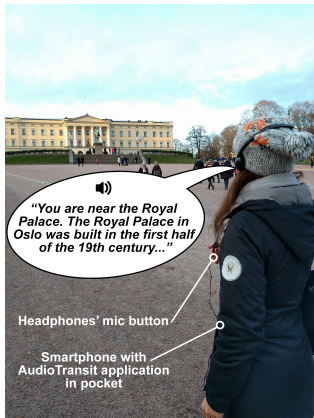
Figure 2: Using AudioTransit to explore Oslo on foot. The user approaches a place of cultural interest and an audio track with cultural information plays automatically.

provide location-based auditory information about nearby sights, minimising the distractions from interacting with mobile devices, and ultimately freeing the users' eyes to observe their surroundings and new environments [2]. Over the years, audio AR tour guides have found application in indoor settings (e.g. museums) [1, 17] and outdoor confined spaces (e.g. zoos) [12, 14].