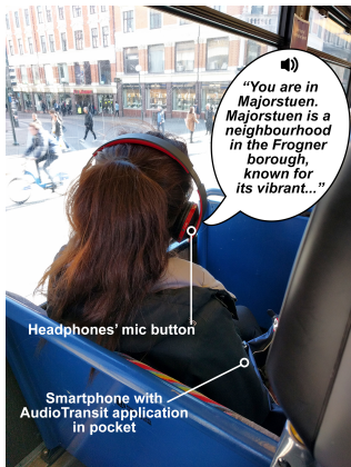
Figure 3: Using AudioTransit to explore Oslo by tram. User gets cultural information about the surrounding area.

Cultural POIs: Sights and city areas of cultural interest that trigger audio tracks with cultural information, e.g. history, architecture, visiting hours.